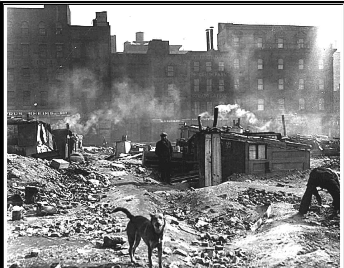
Hooverville, c. 1934